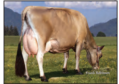
SUNSET CANYON IMPULS L MAID 4-ET Fourth Dam of Lot 2

YOSEMITE VICEROY ISAAC 35864 85% JE840003137374887 GT9K BBR 100 JH1F DHIA HERD # 93-24-0571 CONTROL # 35864 1-08 283 3 20060 4.9 986 3.5 712 93DCR 2461C 2-07 274 3 20180 4.8 973 3.8 762 83DCR 2614C 305 2X ME AVG 2L 24580M 1206F 912P 3148C PPA 2648M 119F 96P / YD 2486M 112F 86P CDCB GPTA S 10/06/2020 3RECS 81%R 99%ILE 832M -0.01% 38F 0.02% 35P 454CM$ 437NM$ 401FM$ 4.4PL 1.5LIV 2.2DPR 3.8CCR 1.7HCR 2.97SCS 431GM$ 0.1MFV 0.3DAB 0.2KET -1.2MAS 0.8MET -0.1RPL 0.74HTI AJCA 10/06/2020 GPTAT 81%R 0.8 GJUI 3.4 GJPI 75%R 116