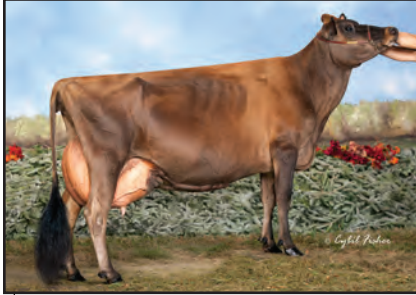
ELLIOTT'S GOLDEN VISTA-ET Sister to the Dam of Lot 11 & 12

LYON CELEBRITY CECE-ET 91% USA 117046049 GT50K BBR 100 JHIC TATTOO J05/J05 DHIA HERD # 33-87-0722 CONTROL # 813 2-02 305 3 18470 4.7 865 3.4 633 100DCR 2187C 4-03 271 3 22660 4.4 999 3.6 823 102DCR 2740C 305 2X ME AVG 2L 19070M 900F 699P 2370C PPA 1421M 85F 50P / YD 347M 58F 15P CDCB GPTA S 10/06/2020 2RECS 89%R 69%ILE -11M 0.13% 28F 0.01% 1P 114CM$ 111NM$ 104FM$ 0.5PL -3.2LIV 0.1DPR -0.3CCR 0.6HCR 2.94SCS 110GM$ 0.0MFV 0.0DAB 0.0KET 0.2MAS -0.2MET 0.3RPL 0.47HTI AJCA 10/06/2020 GPTAT 87%R 0.7 GJUI 0.8 GJPI 85%R 29