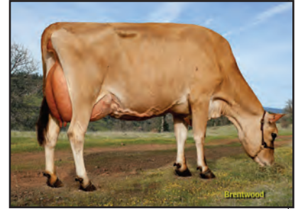
BW IATOLA CLAIRE ET525-ET Great-Grandam of Lot A