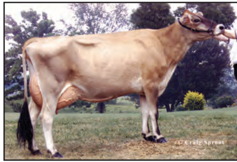
Sold in the 2002 All American Sale Nobledale Pitino Victoria, E-94% 3-4 305 21,030 4.3% 902 3.2% 671