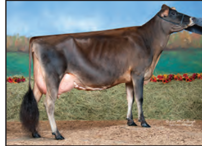
BUDJON-VAIL SAMBO GLENNA-ET Sister to the Dam of Lot 44