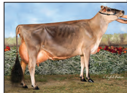
HILLACRES MORRAE MARYLAND Grandam of Lot 34