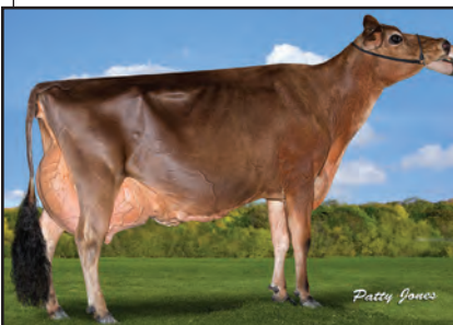
BRIDON IATOLA POLISH-ET Sister to the Grandam of Lot 43