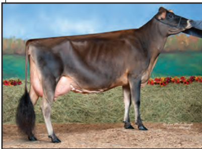
BUDJON-VAIL SAMBO GLENNA-ET Sister to the Dam of Lot 15