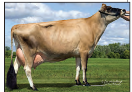
SCHULTE BROS VIN GLAMOUR GIRL Sister to Lot 38