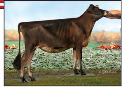
SCHULTE BROS TEQ GLORY-ET Selling as Lot 38

4TH DAM: SANCREST EASY SPIRIT 82% 2-01 305 2 9870 4.8 475 3.9 380 DHIR 1237C