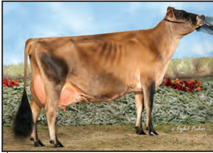
HURONIA CENTURION VERONICA 20J Grandam of Lot 11 & 12

BRED: 09/03/2020 DUE: 06/08/2021 TO ELLIOTT'S REGENCY CASINO-ET JE840003125141657 141E725 CDCB GPTA S 08/01/2020 866DAUS 173HRDS 85%RIP 98%R -320M 0.05% -4F 31%ILE 98%R 0.09% 8P 125CM$ 100NM$ 43FM$ 95GM$ 1.7PL 0.5LIV 0.2DPR -0.1CCR 1.9HCR 3.15SCS 0.0MFV 0.3DAB 0.0KET -2.1MAS -0.2MET 0.1RPL -2.30HTI AJCA 08/01/2020 447DAUS GPTAT 97%R 1.9 GJUI 15.5 GJPI 91%R 14