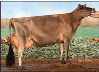
JASMARI VERB LIL VERONA-ET Sister to Lot 27