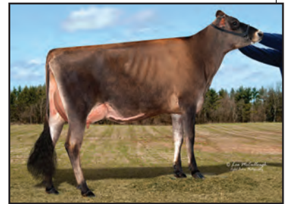
HER-MAN IMPRESSIVE MADRID-ET Sister to the Dam of Lot 20