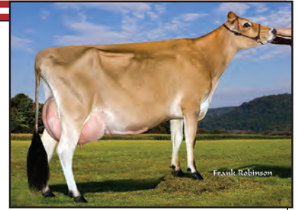
SUNSET CANYON VALEN I MAID 114-ET Great-Granddam of Lot 2

CDF KARBALA KWYNN JE840003005791893 GT50K BBR 100 JH1C 11JE1110 CDCB GPTA S 08/01/2020 902DAUS 84HRDS 3%RIP 99%R 13M 0.12% 27F 67%ILE 99%R 0.06% 14P 301CM$ 275NM$ 219FM$ 238GM$ 2.2PL 0.6LIV -0.4DPR 0.7CCR 0.8HCR 2.76SCS 0.1MFV -0.1DAB 0.5KET 1.6MAS -0.5MET -0.1RPL 3.73HTI AJCA 08/01/2020 498DAUS GPTAT 98%R 1.2 GJUI 12.1 GJPI 96%R 76