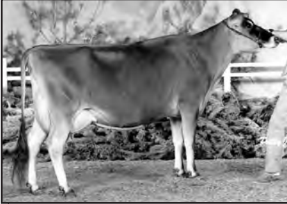
NORVAL ACRES JODYS DELCY 4U Great-Grandam of Lot 25