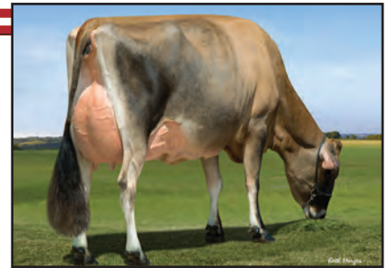
ELLIOTTS EXCITING CHAMBORD-ET Grandam of Lot 14

SISTER(S): ELLIOTTS GOLD CONFETTI 92% 3-00 305 2 16780 5.7 956 3.9 652 96DCR 2257C ELLIOTTS COSMO ACTION-ET 93% 3-04 305 2 23470 5.4 1260 3.6 839 86DCR 2901C INTERMEDIATE CHAMPION, 2014 MID-ATLANTIC REGIONAL RESERVE GRAND, 2014 MID-ATLANTIC REGIONAL RESERVE GRAND CHAMPION, 2013 MARYLAND STATE FAIR ELLIOTTS CORONA ACTION-ET 94% 2-03 305 2 16160 4.2 674 3.4 552 96DCR 1842C RESERVE GRAND CHAMPION, 2016 SOUTHWESTERN EXPO 3RD SR 2-YEAR-OLD, 2013 MID-ATLANTIC REGIONAL 3RD SR 2-YEAR-OLD, 2013 MARYLAND STATE FAIR ELLIOTTS EXCITING CABERNET-ET 91% 6-00 305 2 20560 4.5 923 3.4 700 96DCR 2418C ELLIOTTS EXCITING CHABLIS-ET 90% 4-10 305 2 18320 6.3 1155 3.9 710 95DCR 2457C ELLIOTTS EXCITING CHAMPAGNE-ET 85% 4-11 305 2 12150 5.4 1144 3.8 817 98DCR 2827C ELLIOTTS EXCITING CHARDONNAY-ET 90% 5-06 305 2 17030 5.2 882 3.7 626 98DCR 2165C ELLIOTTS BLACKSTONE CHARLOTTE-ET 94% 5-02 305 2 23600 6.2 1454 3.6 844 95DCR 2918C 1ST AGED COW, 2018 NY SPRING CAROUSEL 1ST 5-YEAR-OLD, 2017 ROYAL AG WINTER FAIR RESERVE GRAND CHAMPION, 2017 WDE JERSEY SHOW 1ST 5-YEAR-OLD, 2017 INTERNATIONAL JERSEY SHOW ELLIOTTS FAXON COMICAL-ET 91% 4-01 305 2 17880 4.8 855 3.6 644 98DCR 2227C 2ND 4-YEAR-OLD, 2016 MARYLAND STATE FAIR 4TH JR 3-YEAR-OLD, 2015 MARYLAND STATE FAIR 3RD JR 2-YEAR-OLD, 2014 MID-ATLANTIC REGIONAL ARETHUSA SHOWDOWN CRYSTAL-ET 89% 3-05 305 2 20540 4.8 990 4.0 816 98DCR 2719C