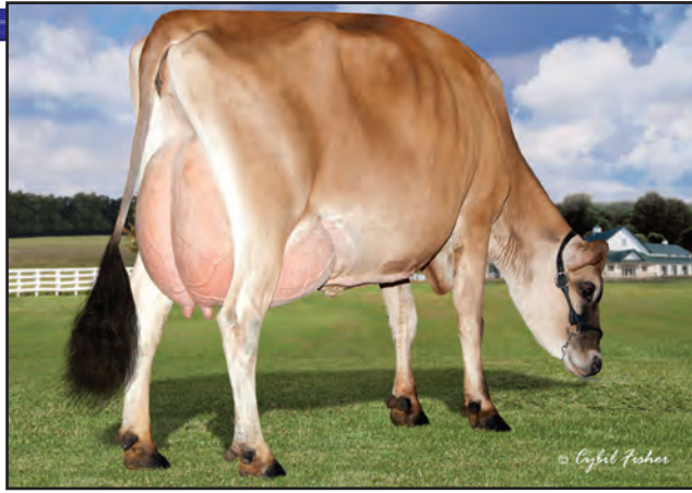
AHLEM VALENTINO BESS 39705, E-93% Grandam of Lot 21