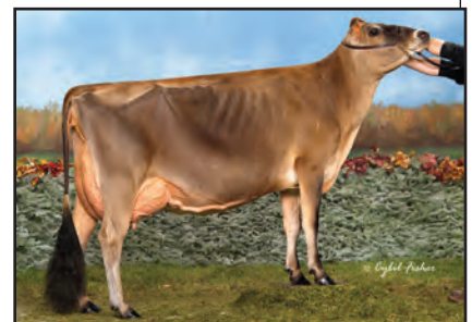
ELLIOTTS COSMO ACTION-ET Sister to the Grandam of Lot 14