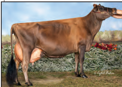
ELLIOTTS GOLDEN VISTA-ET Great-Grandam of Lot 13