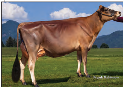
LADY LANE LADD KIN Sister to the Dam of Lot 23