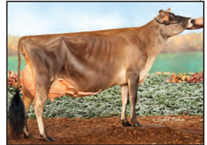
DISCOVERYS TEQUILA JEWELENE Grandam of Lot 8