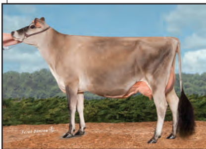
COWBELL GUAPO OREILLY-ET Sister to the Dam of Lot 39