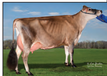
KEVETTA CITATION A VERNA-ET Sister to Lot 16