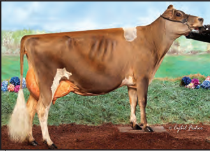
JASMARI VITALITY LIL FOXY Sister to Lot 27