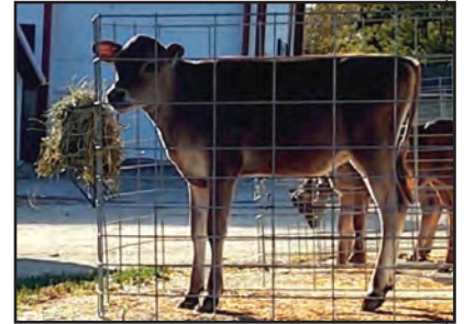
LOST-BROOKE CHOICE LOVE STRUCK Selling as Lot 28

IGL SANTANA TORPEDO-ET JE840003125325348 GT80K BBR 100 JH1F 250JE1456 CDCB GPTA S 08/01/2020 1118DAUS 163HRDS 29%RIP 99%R 344M -0.07% 2F 24%ILE 99%R -0.04% 5P 72CM$ 79NM$ 96FM$ 27GM$ 1.4PL -1.5LIV -2.2DPR -2.1CCR 0.8HCR 2.93SCS 0.1MFV 0.1DAB 0.2KET -0.5MAS 0.3MET 0.0RPL 0.94HTI AJCA 08/01/2020 519DAUS GPTAT 98%R 0.9 GJUI 15.8 GJPI 94%R 20