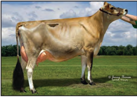
Sold in the 2016 All American Sale TJ Classic Action Venus, E-93% Projected to 24,878—1,285—896 ME at 5-1