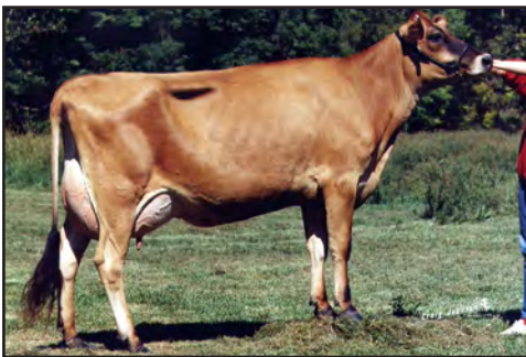
Sold in the 1990 All American Duncan Nanni, E-92% 6-4 305 25,310 4.5% 1,148 3.5% 882 DHIR 4th Sr. 2-yr.-old cow, 1990 All American