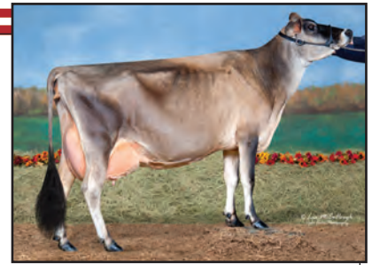
DREAMROAD ZBW IATOLA CRACKER-ET Dam of Lot 24

SCHULTZ LEGAL CRITIC-P USA 117217618 GT50K BBR 100 JH1C 11JE1098 CDCB GPTA S 08/01/2020 4108DAUS 386HRDS 3%RIP 99%R -3M 0.05% 11F 46%ILE 99%R 0.03% 6P 196CM$ 184NM$ 159FM$ 136GM$ 3.0PL 1.0LIV -0.7DPR -0.7CCR -1.6HCR 2.90SCS -0.2MFV 0.3DAB 0.8KET 0.8MAS 0.4MET 0.0RPL 1.90HTI AJCA 08/01/2020 2568DAUS GPTAT 99%R 0.9 GJUI 9.1 GJPI 99%R 54