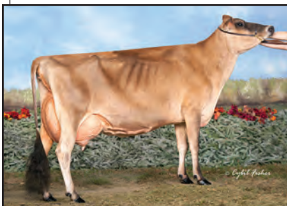
ELLIOTTS VIVID DELUXE Grandam of Lot 13