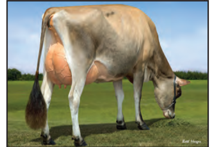
STEESHANIE IATOLA TINKERBELL Dam of Lot 22

2ND SR 2-YEAR-OLD, 2015 INTERNATIONAL JR SHOW 4TH SR 2-YEAR-OLD, 2015 MID-ATLANTIC REGIONAL 1ST SR 2-YEAR-OLD, 2015 MID-ATLANTIC REGIONAL JR SHOW INTERMEDIATE CHAMP, 2015 MID-ATLANTIC REGIONAL JUNIOR SHOW 2ND SR 2-YEAR-OLD, 2015 NY SPRING CAROUSEL JR CHAMPION, 2014 INTERNATIONAL JR JERSEY SHOW JR CHAMPION, 2014 MID-ATLANTIC REGIONAL JR CHAMPION, 2014 MID-ATLANTIC REGIONAL JR SHOW 1ST INTERMEDIATE YEARLING, 2014 MD STATE FAIR JR CHAMPION, 2014 NY SPRING CAROUSEL JR & OPEN SHOW 1ST INTERMEDIATE YEARLING, 2014 NY SPRING CAROUSEL OPEN & JR SHOW