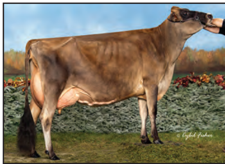
Sold in the 2013 All American Sale Forever Little T of TJ Classic, E-90% 16,521—696—544 ME at 3-2