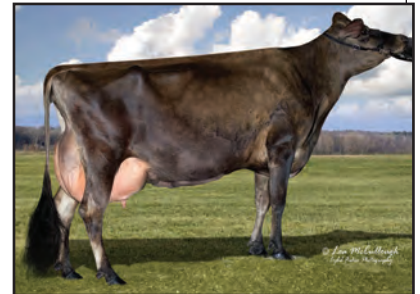
THOMSEN 4226 CADILLAC JAY {5} Fourth Dam of Lot 8