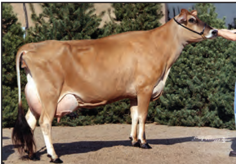
Sold in the 1999 All American Sale Headspring Berretta Push, E-92% 3-9 305 31,110 4.5% 1,403 3.7% 1,153 DHIR