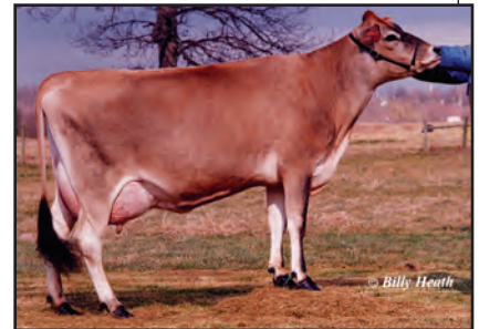
VAN DE BERRETTE VENTURA PROMISE, E-90% Eighth Dam of Lot 18