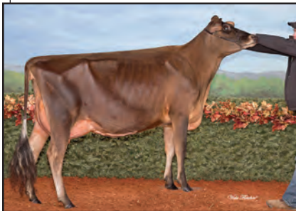
MUSQIE COLTON MAJESTY-ET Sister to the Dam of Lot 37