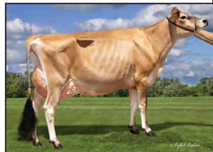
KEVETTA CHROME VIOLIN-ET Sister to Lot 16