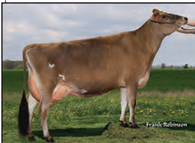
BUDJON-VAIL SULTAN GUCCI-ET Sister to the Dam of Lot 15