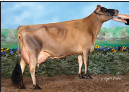
ARETHUSA VALIANT GUCCI-ET Sister to the Dam of Lot 43