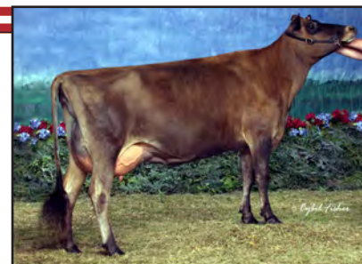
HOMERIDGE F P LISA 2 Grandam of Lot 36

4TH DAM: HOMERIDGE V R LISA 9Z SUP-EX 90 (CAN) 10-08 305 2 12641 4.7 598 3.7 465 CAN 1602C NEXT DAM IS A VERY GOOD-85 IN CANADA