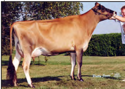
AVONLEA RENAISSANCE MISCHIEFF Great-Grandam of Lot 37