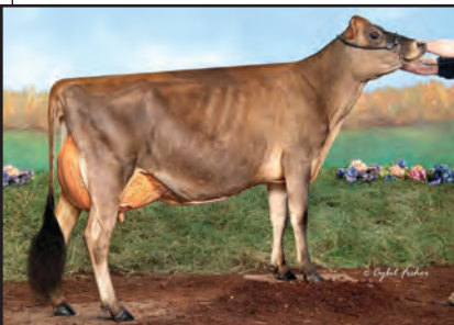
JASMARI SULTAN LIL SENSATION-ET Sister to Lot 27