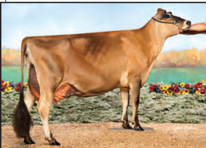
JASMARI GUAPO LIL CARINA-ET Sister to Lot 27