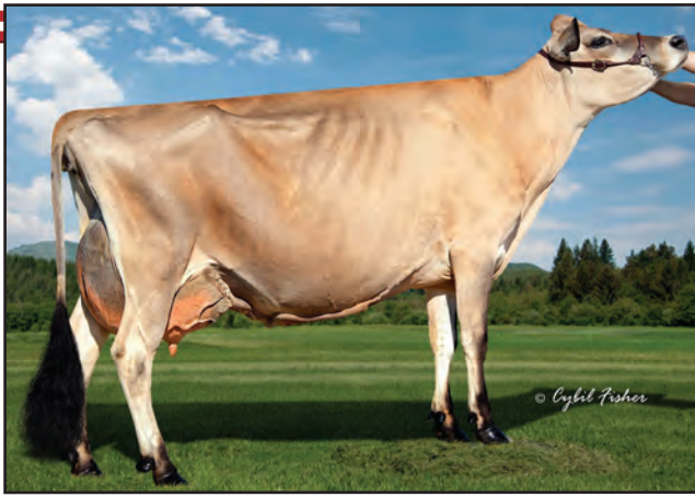
FAMILY HILL JADE FIREY-ET, E-95% Great-Grandam of Lot 40