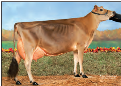
JX EDAN SWEET PROMISE {5} Great-Grandam of Lot 19

HILLVIEW LISTOWEL-P USA 067333440 GT99K BBR 100 JH1F 200JE1045 CDCB GPTA S 08/01/2020 1527DAUS 114HRDS 41%RIP 99%R 1274M -0.04% 53F 97%ILE 99%R 0.01% 50P 521CM$ 495NM$ 444FM$ 397GM$ 3.9PL 1.7LIV -1.4DPR 0.5CCR 1.2HCR 2.69SCS 0.2MFV 0.5DAB -0.1KET 2.1MAS 0.3MET 0.0RPL 7.91HTI AJCA 08/01/2020 953DAUS GPTAT 99%R 0.5 GJUI -1.6 GJPI 94%R 153