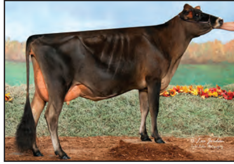
Sold in the 2017 All American Sale Discoverys Tequila Jeneva-ET, VG-88% 1-11 269 2x 13,480 4.6% 616 4.0% 534