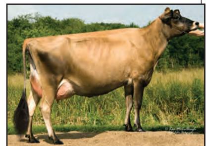
ARETHUSA VERONICAS VIXEN-ET Fourth Dam of Lot 10