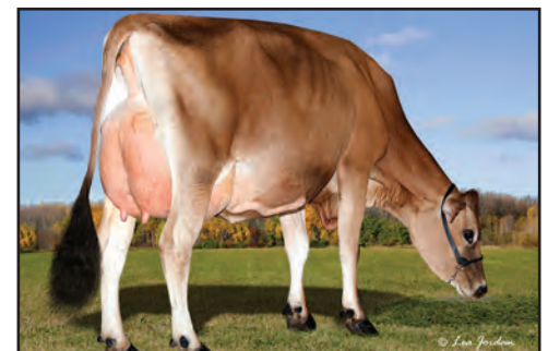
Sold in the 2015 All American Legendairy Mackenzie Brileigh-ET, E-91% 2-0 305 21,310 6.6% 1,416 3.8% 820