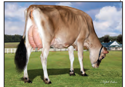
GOLDUST KARBALA LAINA-ET Great-Grandam of Lot 28

RIVER VALLEY AXIS CAMERON 1053-ET 82% JE840003103097853 GT13K BBR 100 JH1F DHIA HERD # 33-87-0722 CONTROL # 1053 PPA -497M 3F -19P / YD -1734M -46F -65P CDCB GPTA S 10/06/2020 1RECS 83%R 82%ILE 590M -0.04% 19F -0.03% 14P 159CM$ 162NM$ 172FM$ 1.5PL -0.5LIV -2.5DPR -2.6CCR 1.3HCR 2.89SCS 86GM$ 0.1MFV 0.1DAB -0.1KET 0.5MAS 0.4MET 0.1RPL 2.40HTI AJCA 10/06/2020 GPTAT 82%R 1.6 GJUI 9.3 GJPI 79%R 28