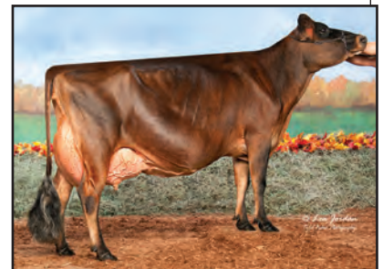
DREAMROAD TBONE CLUMSY, E-96% From the Same Family as Lot 24

SISTER(S): DREAMROAD BELLS EXPO CHRISTINE 90% 6-08 305 2 15910 5.7 900 3.7 590 98DCR 2041C DREAMROAD BERRETТА CAROL 91% 7-03 305 2 24190 4.8 1158 3.6 867 99DCR 2998C DREAMROAD PANTO CLARRISA 83% 3-10 305 2 15160 4.1 629 3.5 538 100DCR 1752C DREAMROAD HALLMARK CALI-ET 87% 2-02 305 2 12570 4.6 575 3.7 467 100DCR 1568C DREAMROAD COUNCILER CASCADE-ET 91% 6-05 305 2 21010 4.0 850 3.4 708 102DCR 2339C DREAMROAD BARBER CANE-ET 93% 3-00 305 2 20670 4.6 956 3.6 735 99DCR 2541C DREAMROAD BARBER CANDY-ET 91% 5-01 279 2 17000 4.7 799 3.4 579 101DCR 2000C DREAMROAD REMAKE CASANDRA-ET 88% 4-07 305 2 18830 4.0 744 3.4 643 102DCR 2081C