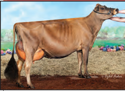
EDN-RU TEQUILA LILAE LILAC Dam of Lot 27

RESERVE ALL AMERICAN SR 2-YEAR-OLD, 2014 8TH SR 2-YEAR-OLD, 2014 MID-ATLANTIC REGIONAL SHOW RESERVE ALL AMERICAN MILKING YEARLING, 2013