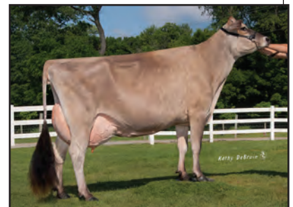
LAKE-POINT AA VALENCIA-ET Grandam of Lot 10