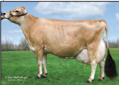
BILLINGS BERRETTA DOROTHY Sister to the Dam of Lot 25