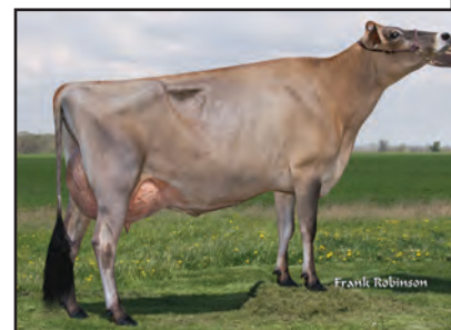
PARTEE AT BUDJON LIBERTY-ET Sister to the Dam of Lot 36