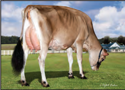
GOLDUST KARBALA LAINA-ET Grandam of Lot 29