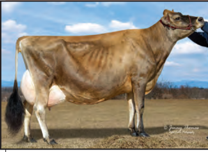
BILLINGS LS BOO BOO Grandam of Lot 35