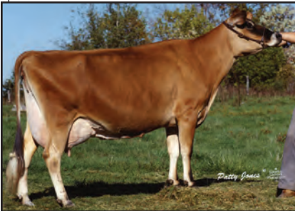
NORVAL ACRES KINGS DELCY 4N Fourth Dam of Lot 25