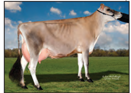
HER-MAN FASTRACK MEAGAN-ET Sister to the Dam of Lot 20