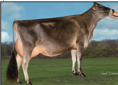
RIVER VALLEY LADD BESSIE-ET Sister to the Dam of Lot 21