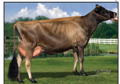
ARETHUSA RESPONSE VANITY-ET Sister to the Dam of Lot 11 & 12