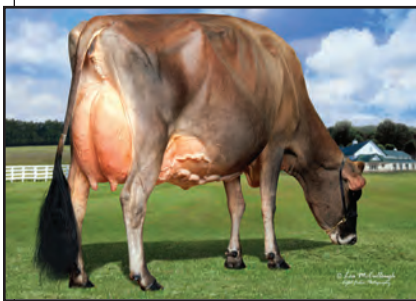
COWBELL GUAPO RICOCHET Sister to the Dam of Lot 39