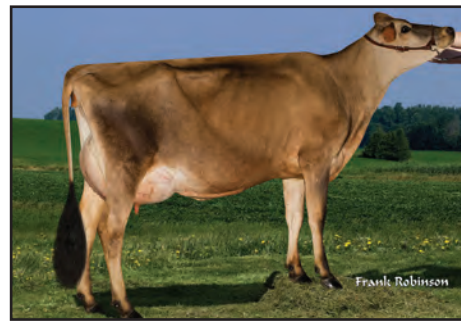
Sold in the 2018 All American Sale Pro-Hart Chrome Brenda, VG-87% 1-10 305 3x 20,100 4.8% 966 3.3% 655