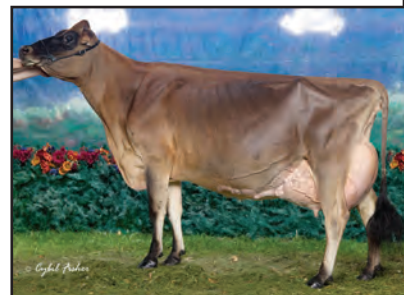
LLOLYN JUDE GRIFFEN-ET Grandam of Lot 44