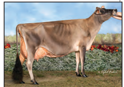
ARETHUSA VERONICAS COMET-ET Sister to the Dam of Lot 11 & 12