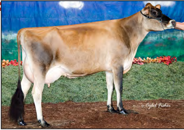
EGGINK JADE BETSY-ET Great-Grandam of Lot 42