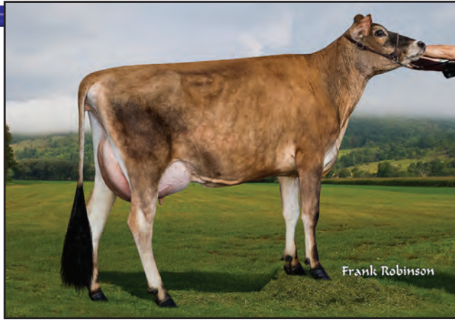
LOST HILL DIMENSION HOLLY, VG-84% Grandam of Lot 1