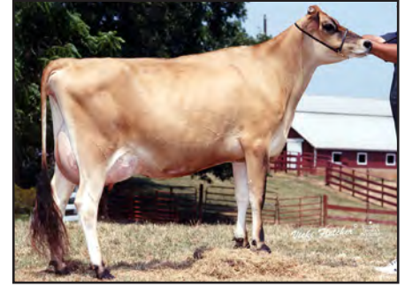
Sold in the 2001 All American Sale Williams Impressive Idea-ET, E-90% 3-5 305 20,096 4.7% 950 3.6% 715 Dam of SC Gold Dust Paramount latola-ET