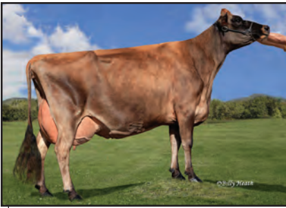
SHEER GRACE Grandam of Lot 43

4TH DAM: SPECIAL MARY 90% 3-08 305 2 15160 3.4 520 3.3 497 DHIR 1478C