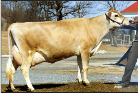
Sold in the 1987 All American Greenridge FW Chief Althea-ET, E-92% 10-4 305 21,240 4.1% 862 3.9% 832 DHIR 15 Sons in A.I.