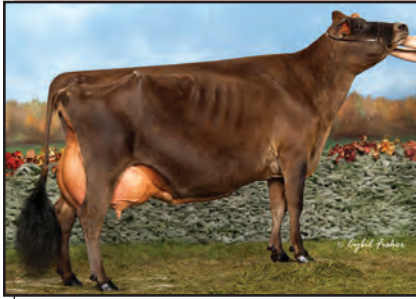
ARETHUSA PRIMETIME DEJA VU-ET Great-Grandam of Lot 31

BORN 03/01/2020 P2 FEMALE EFI 6.7% AMERICAN ID 1054/1054