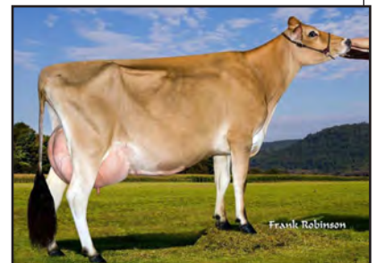
SUNSET CANYON VALEN I MAID 113-ET, VG-87% From the Same Family as Lot 2