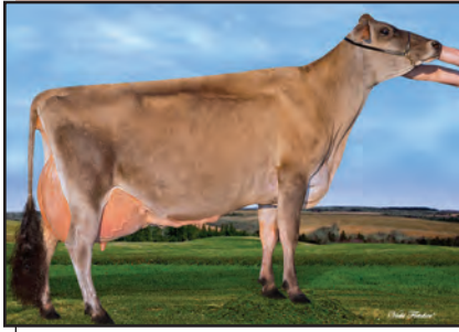
ELOC IATOLA MATILDA-ET Dam of Lot 37