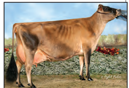
HURONIA CENTURION VERONICA 20J Fourth Dam of Lot 14