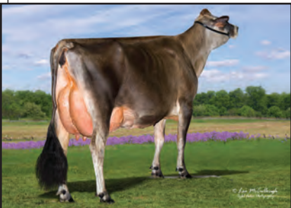
RATLIFF RES RAIZEL-ET Sister to the Dam of Lot 5