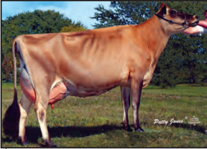
PREMONITION GRACE Great-Grandam of Lot 43