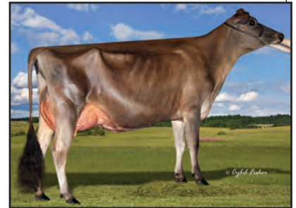
BIG GUNS ANDREAS VANISH-ET Sister to the Dam of Lot 26