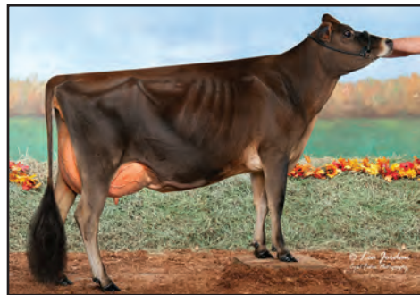
Sold in the 2016 All American Sale Billings Tequila Serena, E-91%