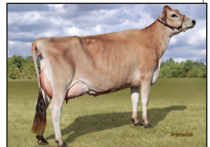
BW MERCHANT CLAIRE IF169-ET Sister to the Grandam of Lot A