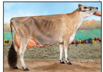
ELLIOTTS CHAVEZ ROXIE-ET Sister to Lot 6