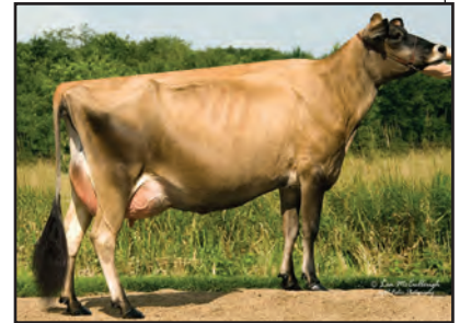
ARETHUSA VERONICAS VIXEN-ET Sister to the Dam of Lot 11 & 12