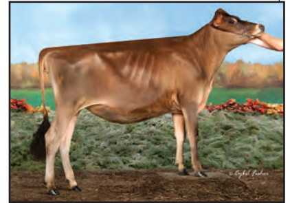
UNDERGROUND LOLLIPOP LUCY-ET Sister to Lot 30

SISTER(S): HEATH YELLOW ROSE FLAME LEAH 83% 2-05 305 2 10380 5.5 568 4.0 415 89DCR 1437C