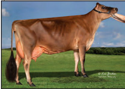
PUZZLES PREMIUM-ET Dam of Lot 7