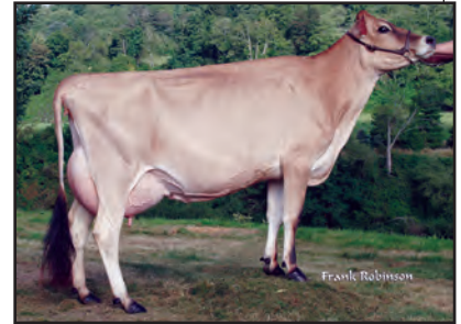
SUNSET CANYON CENTURION MAID Fourth Dam of Lot 20