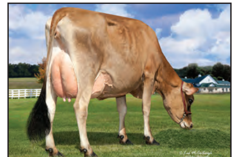
Sold in the 2010 All American Sale Hi-Kel TBone Pfenning-ET, E-90% 3-7 305 3x 21,200 4.8% 1,015 3.7% 781