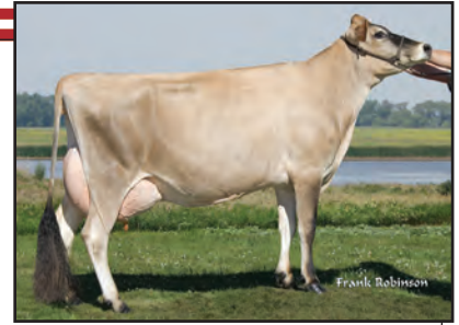
THREE VALLEYS COUNTRY MAID 3-ET Great-Grandam of Lot 20