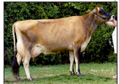
COWBELL ROYAL CASSIDY Great-Grandam of Lot 24

SC GOLD DUST PARAMOUNT IATOLA-ET USA 112118277 GTHD BBR 100 JH1F 29JE3301 CDCB GPTA S 08/01/2020 18671DAUS 2641HRDS 6%RIP 99%R -849M 0.11% -18F 9%ILE 99%R 0.05% -21P -125CM$ -132NM$ -149FM$ -78GM$ -0.9PL -2.2LIV 1.0DPR 0.9CCR -0.5HCR 2.97SCS -0.2MFV -0.5DAB -0.1KET 1.7MAS 0.0MET 0.2RPL -1.31HTI AJCA 08/01/2020 9649DAUS GPTAT 99%R 0.6 GJUI 1.9 GJPI 99%R -39