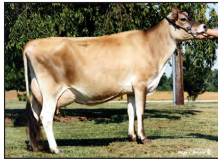
Sold in the 1992 All American Sale Sweet Grass 2875 Gurit-ET, E-90% 1-11 305 17,390 4.4% 956 3.6% 620