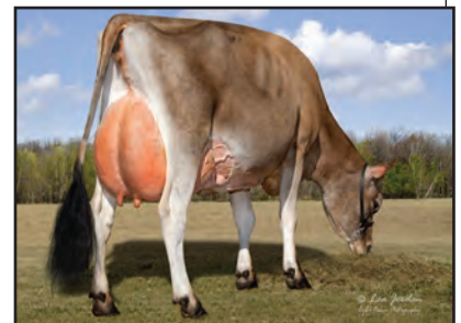
ELLIOTTS CHAVEZ RENEE-ET Sister to Lot 6