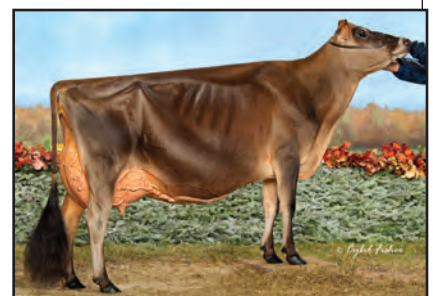
ELLIOTTS BLACKSTONE CHARLOTTE-ET Sister to the Grandam of Lot 14