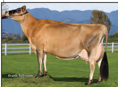
FAMILY HILL GOLDEN NAOMI Great-Grandam of Lot 17

TOWER VUE PRIME TEQUILA-ET USA 114816452 GTHD BBR 100 JH1F 76JE156 CDCB GPTA S 08/01/2020 5422DAUS 1552HRDS 7%RIP 99%R -2064M 0.22% -57F 1%ILE 99%R 0.09% -58P -599CM$ -596NM$ -599FM$ -588GM$ -3.9PL -4.8LIV -3.3DPR -4.6CCR -2.0HCR 3.38SCS 0.0MFV -0.5DAB -0.3KET -1.6MAS 1.0MET 0.3RPL -4.90HTI AJCA 08/01/2020 3584DAUS GPTAT 99%R 1.1 GJUI 12.1 GJPI 99%R -206