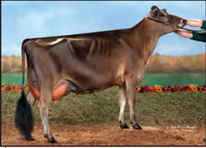
RATLIFF GOLD REGINA-ET Dam of Lot 5