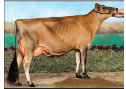
DISCOVERYS VERBATIM JUNIPER Sister to the Dam of Lot 8

SISTER(S): DISCOVERYS TEQUILA JASPER 90% 3-01 305 2 24239 5.7 1392 3.7 901 DHIA 3117C DISCOVERYS TEQUILA RUBY-ET 90% 4-01 305 2 14050 5.1 716 3.9 549 98DCR 1900C DISCOVERYS TEQUILA JADE-ET 88% 2-11 276 2 8810 5.6 490 3.8 338 95DCR 1169C DISCOVERYS TEQUILA JENEVA-ET 88% 1-11 269 2 13480 4.6 616 4.0 534 93DCR 1729C DISCOVERYS TEQUILA JAYDEN-ET 86% 2-06 305 2 11350 4.3 491 3.6 413 97DCR 1358C DISCOVERYS TEQUILA JEWELS-ET 80% 3RD SR HEIFER CALF, 2017 ALL AMERICAN SHOW 1ST SR HEIFER CALF, 2017 EASTERN STATES EXPOSITION RESERVE JUNIOR CHAMPION, 2017 EASTERN STATES EXPO SENIOR HEIFER CALF, 2017 ILLINOIS STATE FAIR DISCOVERYS TEQUILA JAVELIN-ET 87% 2-11 279 2 11280 4.6 516 3.7 417 95DCR 1404C