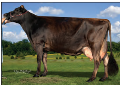
JX PEARLMONT D DAVY EMBRACE {4} Fourth Dam of Lot 19