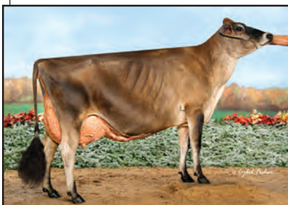
RATLIFF IMPRESSION DONNER-ET Full Sister to the Grandam of Lot 31