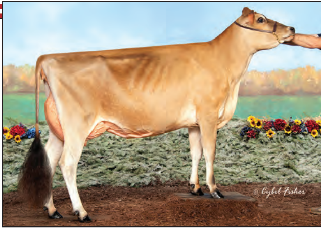
RIVER VALLEY CITATION LOVELY-ET, VG-89% Grandam of Lot 28