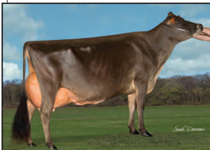
RATLIFF SAMBO DAPHNE-ET Sister to the Grandam of Lot 31