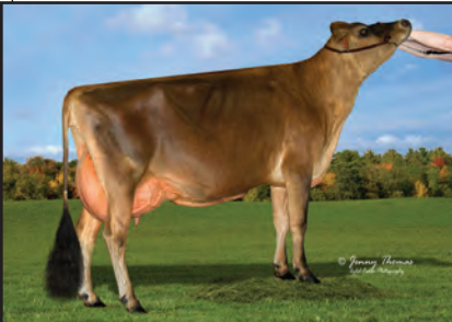
BILLINGS MINISTER BREIGH Sister to the Dam of Lot 35