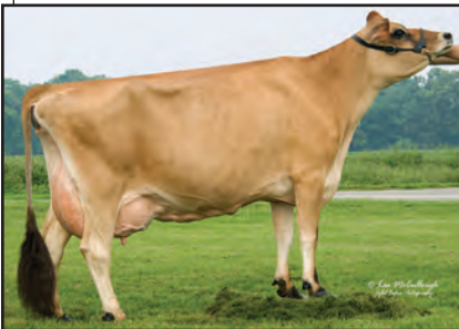
GORDONS COUNCILLER GIDGET Sister to the Dam of Lot 43