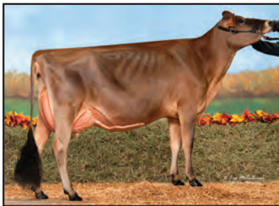
MISS NASTIAS TEQUILA NUTCRACKER-ET Dam of Lot 17

BORN 06/01/2019 TATTOO /J40 PO FEMALE EFI 6.1% PA -1531M -44F -41P -284CM$ -289NM$ -303FM$ -0.7PL 0.2DPR -0.5CCR -0.7HCR 3.12SCS PA TYPE 1.1 JPI 43%R -91 ST SR DF RA RW RL FA FU 1.6 -0.2 1.3 H1.2 0.6 PO.4 SO.3 2.0 RH RW UC UD TP TL RTR RTS 1.6 1.1 0.7 S2.1 CO.3 L1.2