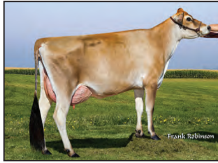
Sold in the 2015 All American Sale Family Hill Connection Can Do-ET, E-92% 4-9 302 14,640 4.4% 647 3.8% 560