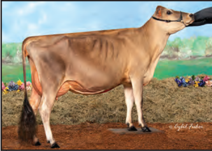
BUDJON-VAIL TEQUILA MACKENZIE Sister to Lot 33