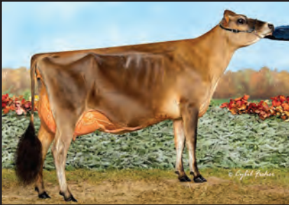
BILLINGS IMPRESSION BOOBOO-ET Sister to the Dam of Lot 35