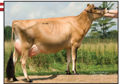
ARETHUSA VERONICAS PRANCER-ET Sister to the Dam of Lot 11 & 12

FOLLOWED BY FOUR MORE EXCELLENT DAMS IN CANADA