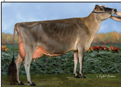
ARETHUSA VERONICAS DASHER-ET Sister to the Dam of Lot 11 & 12

NEXT DAM: GENESIS RENAISSANCE VIVIANNE VG 87 (CAN) 5-00 303 2 12110 4.2 514 3.8 461 CAN 1464C 7 STAR BROOD COW IN CANADA, SEPTEMBER 2012 SIRE: HOLLYLANE RENAISSANCE JPI -180 0%ILE