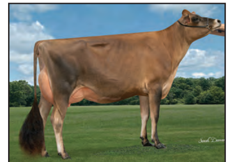
Sold in the 2019 All American Sale Sugar & Spice Fizz Vallery-ET, E-91% Projected to 20,375—879—659 ME at 3-6