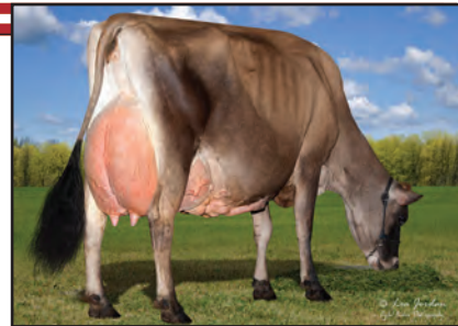
OAKFIELD TBONE VIVIANNE-ET Dam of Lot 16

4TH DAM: GENESIS RENAISSANCE VIVIANNE VG 87 (CAN) 5-00 303 2 12110 4.2 514 3.8 461 CAN 1464C 7 STAR BROOD COW IN CANADA, SEPTEMBER 2012