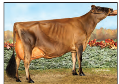
ARETHUSA RESPONSE VIVID-ET Sister to the Dam of Lot 11 & 12