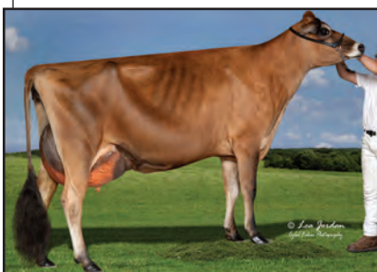
COWBELL IMPRESSION ROWDY Sister to Lot 39