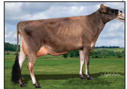
DISCOVERYS SHOWDOWN GIOVANNA-ET Sister to the Dam of Lot 8