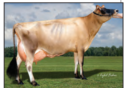
SCHULTE BROS VIN GRACIE-ET Sister to Lot 38