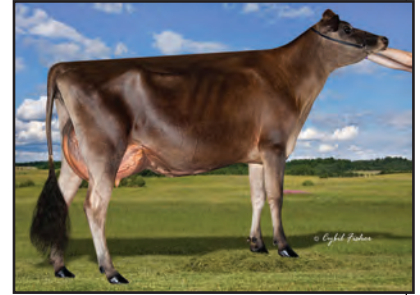
BIG GUNS ANDREAS VICTORY-ET Sister to the Dam of Lot 26