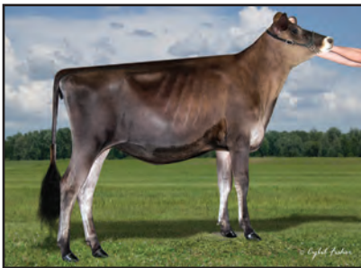
WHITDALE GENTRY GRACEFUL-ET Sister to Lot 15