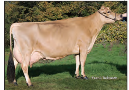
SUNSET CANON LEMVIG MAID 4-ET Fifth Dam of Lot 2

JX SUNSET CANYON GOT MAID {5}-ET USA 119407594 GT99K BBR 100 JH1F 551JE1650 CDCB GPTA S 08/01/2020 1723DAUS 76HRDS 74%RIP 99%R 1615M -0.01% 75F 99%ILE 99%R 0.02% 63P 580CM$ 550NM$ 488FM$ 407GM$ 4.1PL -2.8LIV -3.0DPR -2.5CCR -0.9HCR 2.67SCS 0.0MFV -0.1DAB 0.2KET -2.1MAS 0.1MET 0.1RPL -3.77HTI AJCA 08/01/2020 889DAUS GPTAT 99%R 0.6 GJUI -3.2 GJPI 93%R 140