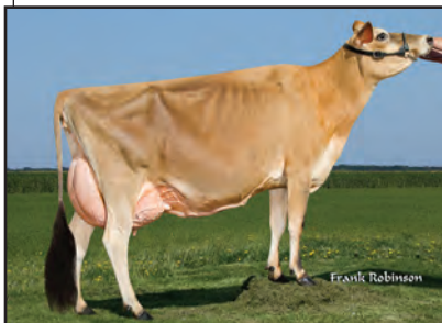
FAMILY HILL COUNCELLER NASTIA Grandam of Lot 17

FAMILY HILL CONNECTION CHILLI-ET 91% USA 114535186 GT3K BBR 100 JH1F TATTOO /F950 DHIA HERD # 51-09-0284 CONTROL # 950 2-04 266 2 17560 7.6 1335 4.0 694 89DCR 2403C 3-04 365 2 27470 6.3 1740 3.8 1038 DHIR 3592C 305 2X ME AVG 1L 23610M 1760F 934P 3234C CDCB GPTA S 10/06/2020 ORECS 90%R 16%ILE -1829M 0.33% -25F 0.15% -38P -101CM$ -129NM$ -191FM$ 0.0PL 0.1LIV 1.8DPR 2.3CCR 0.2HCR 2.93SCS -57GM$ -0.1MFV -0.1DAB -0.5KET 0.8MAS 0.6MET 0.2RPL -0.35HTI AJCA 10/06/2020 GPTAT 87%R 0.9 GJUI 7.9 GJPI 85%R -34