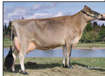
COZZ-MAR THUNDER GENEVIEVE Sister to the Dam of Lot 44