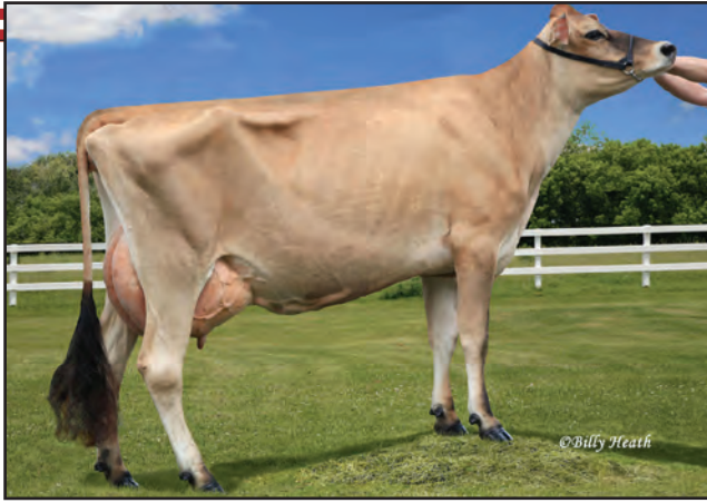
THREE VALLEYS TBONE C MAYBELL-ET, E-90% Grandam of Lot 20