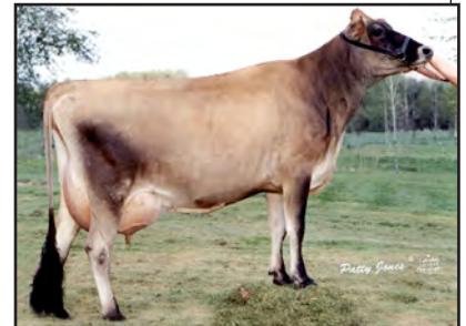
DREAMROAD BERRETТА CAROL Sister to the Grandam of Lot 24

DREAMROAD GOLDEN CRACKLE 94% USA 067000330 DHIA HERD # 21-26-0831 CONTROL # 330 2-03 305 2 14120 4.8 682 3.6 502 99DCR 1735C 3-03 305 2 16890 5.1 862 3.4 581 99DCR 2007C 6-00 305 2 25520 4.6 1176 3.4 866 60DCR 2992C 305 2X ME AVG 5L 16143M 786F 554P 1915C PPA -1340M 10F -56P / YD -2673M -60F -95P CDCB PTA 08/01/2020 4RECS 63%R 4%ILE -1744M 0.18% -50F 0.02% -60P -372CM$ -364NM$ -344FM$ -0.6PL 0.1LIV 2.8DPR 3.5CCR 0.7HCR 2.77SCS -255GM$ -0.1MFV 0.0DAB -0.3KET 2.2MAS 0.8MET 0.4RPL 2.99HTI AJCA 08/01/2020 PTAT 59%R 0.1 JUI 1.9 JPI 55%R -95