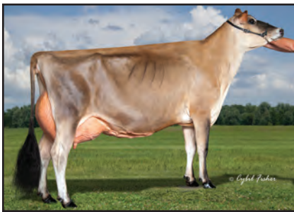
EK-RR TEQUILA VARIETY-ET Dam of Lot 13