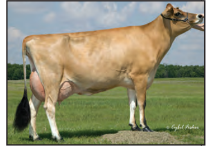
MI WIL DELUXE GORGEOUS Dam of Lot 38