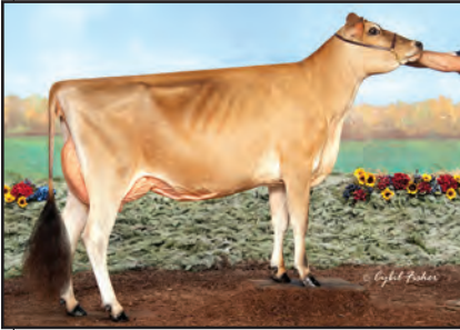
RIVER VALLEY CITATION LOVELY-ET Dam of Lot 29

NEXT DAM IS VERY GOOD FOLLOWED BY TWO EXCELLENT DAMS