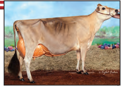
MARYNOLE EXCITE ROSEY Dam of Lot 6