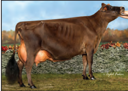
ARETHUSA PRIMETIME DEJA VU-ET Sister to the Dam of Lot 11 & 12

WINNER 2015 GREAT COW CONTEST 2004 NATIONAL GRAND CHAMPION SUPREME CHAMPION, 2006 WDE & PA ALL-AMERICAN GRAND CHAMPION, 2004, 2005 & 2006 CENTRAL NATIONAL INTERMEDIATE AND RESERVE GRAND CHAMPION, 2002 CENTRAL NATIONAL, ALL AMERICAN & RAWF RESERVE GRAND CHAMPION, 2007 CENTRAL NATIONAL SHOW RESERVE ALL-AMERICAN AGED COW, 2011 ALLBREEDS ACCESS SIRE: SOONER CENTURION-ET GJPI -68 3%ILE