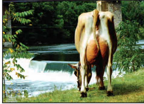
Sold in the 1993 All American Sale Hases Babes Lad Charo, EX 2 (CAN) 4-3 365 39,550 4.4% 1,726 3.6% 1,410 CAN