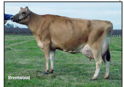
BW CENTURION PEGGY K798 Fourth Dam of Lot A