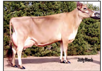
PLEASANT NOOK BERRETTA FELICE, E-95% From the Same Family as Lot 40

SISTER(S): ROYALTY RIDGE FIREYS FERRARI 86% 4-00 272 2 11860 4.2 500 3.6 426 98DCR 1391C 3RD SR 2-YEAR-OLD, 2017 WESTERN NATIONAL JR SHOW 5TH SR 2-YEAR-OLD, 2017 WESTERN NATIONAL ROYALTY RIDGE SHOWDOWN FRENZY 84% 1-09 305 2 13970 5.5 773 3.8 525 95DCR 1816C