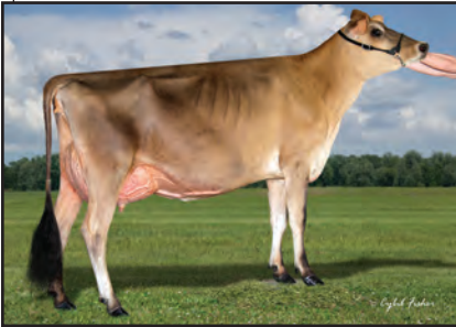
BUDJON-VAIL VIP MACKENNA-ET Sister to Lot 33