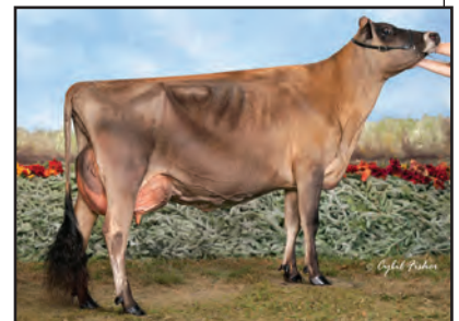
ARETHUSA FIRST PRIZE VIENNA-ET Great-Grandam of Lot 10