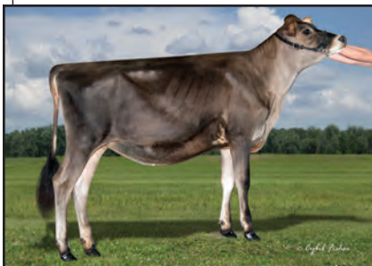
BUDJON-VAIL SHUTOUT VENGEANCE-ET Sister to Lot 13