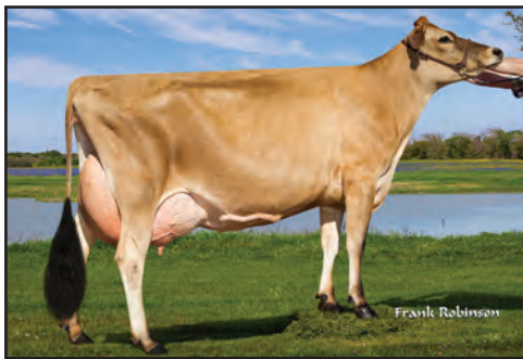
Sold in the 2015 All American Sale Spring Creek Chili Ivana-ET, E-90% 3-8 305 21,710 5.5% 1,188 3.9% 844