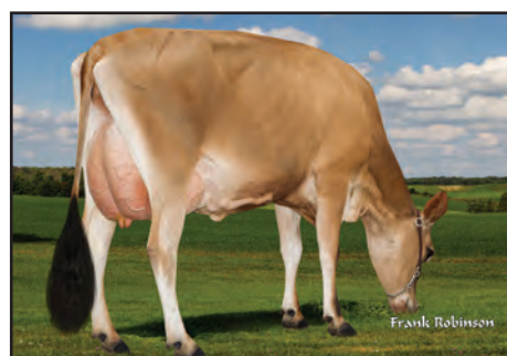
Sold in the 2015 All American Sale Avon Road Regency Lucky, VG-88% 3-8 286 21,640 4.8% 1049 3.9% 842