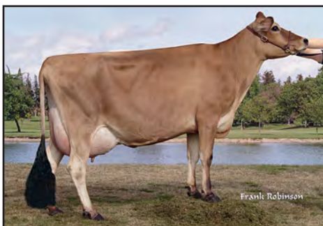
Sold in the 2005 All American Sale D&E Abe Cindy, VG-87% 3-7 305 19,510 4.6% 897 3.6% 706