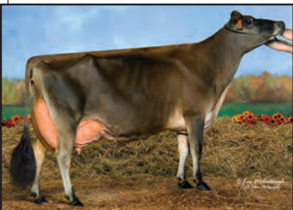
RATLIFF PRICE ALICIA, E-95% From the Same Family as Lot 5