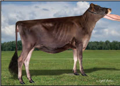
BUDJON-VAIL ANDREAS AUBURN {6} Sister to Lot 9

4TH DAM: TWISTED-K LEGION SUNFLOWER {2} 85%