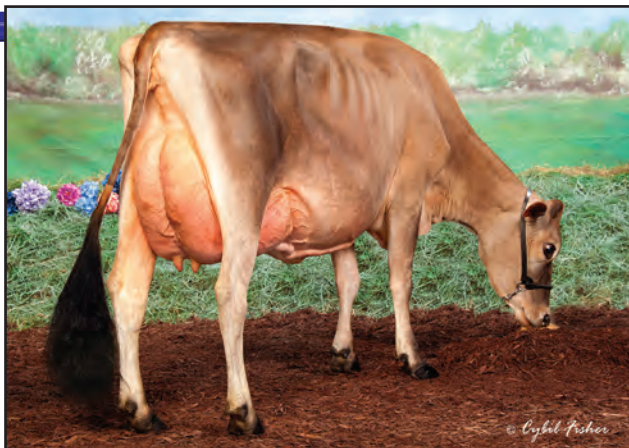
JX EDAN ELEGANT PROPOSAL {6}, E-93% Grandam of Lot 19