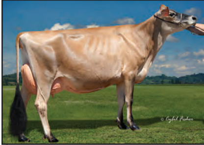
LADY-LANE TEQUILA KHLOE-ET Dam of Lot 23