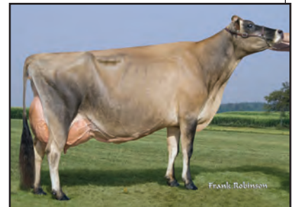
FAMILY HILL SAMBO FERN, E-95% From the Same Family as Lot 40