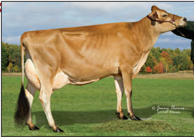
LUCKY HILL JOKER PHILOPSIE, E-90% Great-Grandam of Lot 18