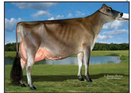
LLR PREMIER TOO LEGIT-ET Sister to Lot 22