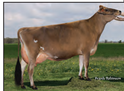
BUDJON-VAIL SULTAN GUCCI-ET Sister to the Dam of Lot 44