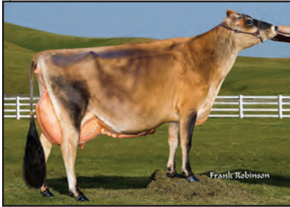
LADY-LANE CVE KASSIE Grandam of Lot 23