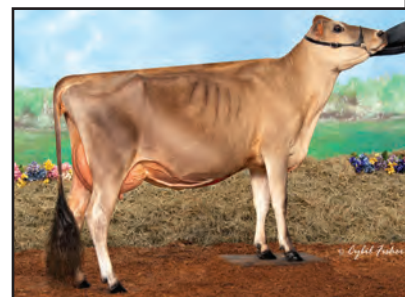
BUDJON-VAIL TEQUILA MACKENZIE Sister to the Dam of Lot 34