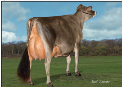
RATLIFF SAMBO DENALI-ET Sister to the Grandam of Lot 31