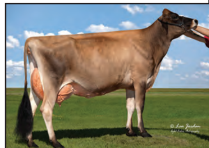
KEVETTA APPLEJACK VEGAS Sister to Lot 16