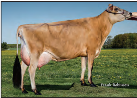
Sold in the 2013 All American Sale Springdale Action Tilli, E-94% 4-9 300 3x 16,010 4.5% 722 3.8% 601