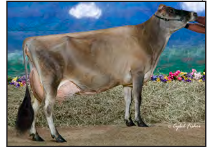
DREAMROAD GOLDEN CRACKLE Grandam of Lot 24

LYON CELEBRITY CECE-ET 91% USA 117046049 GT50K BBR 100 JH1C TATTOO J05/J05 DHIA HERD # 33-87-0722 CONTROL # 813 2-02 305 3 18470 4.7 865 3.4 633 100DCR 2187C 4-03 271 3 22660 4.4 999 3.6 823 102DCR 2740C 305 2X ME AVG 2L 19070M 900F 699P 2370C PPA 1421M 85F 50P / YD 347M 58F 15P CDCB GPTA S 10/06/2020 2RECS 89%R 69%ILE -11M 0.13% 28F 0.01% 1P 114CM$ 111NM$ 104FM$ 0.5PL -3.2LIV 0.1DPR -0.3CCR 0.6HCR 2.94SCS 110GM$ 0.0MFV 0.0DAB 0.0KET 0.2MAS -0.2MET 0.3RPL 0.47HTI AJCA 10/06/2020 GPTAT 87%R 0.7 GJUI 0.8 GJPI 85%R 29