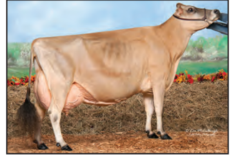
Sold in the 2006 All American Sale Sambo Fabulous-ET, E-93% 5-5 305 19,420 4.4% 862 3.5% 674