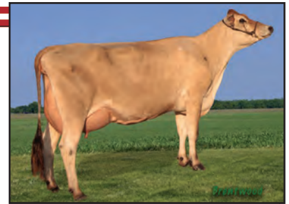
JX BW GOT MAID MADDIE C450 {6} Dam of Lot A