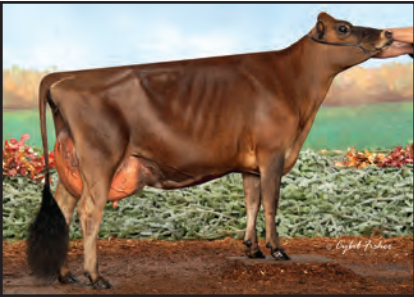
RATLIFF TEQUILA RADIANCE Selling as Lot 5