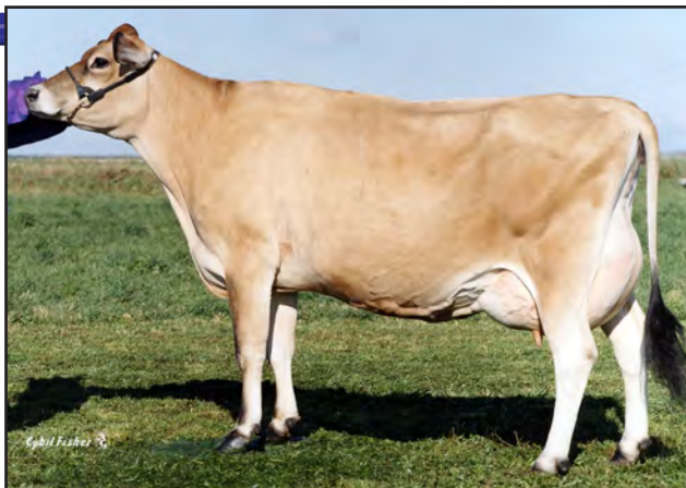
VALHALLA JUDE LESLIE, VG-89% From the Same Family as Lot 41