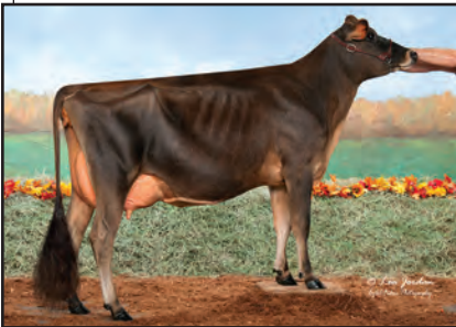
CARLY-O TEQUILA ALWAYS {4}-ET Sister to the Grandam of Lot 9