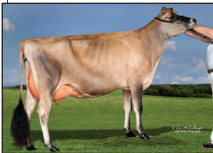
COWBELL GUAPO RODEO Dam of Lot 39