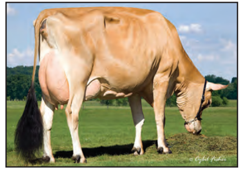
Sold in the 2010 All American Sale Billings RBR Style, VG-89% 2-8 305 17,970 5.1% 911 3.8% 686