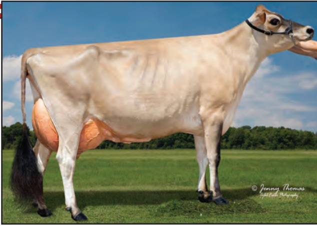
UNDERGROUND LEAHS LOLLIPOP, E-94% Dam of Lot 30