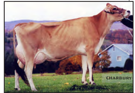
NEW DIRECTION PREMIER-ET, VG-87% Seventh Dam of Lot 18

4TH DAM: LUCKY HILL NUTBROWN PHOOLISH 78% 2-06 305 2 15090 5.7 861 4.2 641 102DCR 2221C