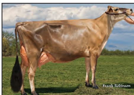
Sold in the 2015 All American Sale DeMents Dazzler Bonnie, E-90% 4-7 305 3x 21,230 5.5% 1,177 4.0% 849