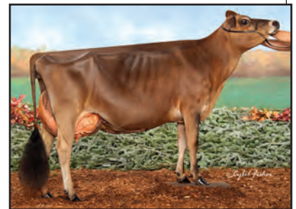
SOUTH MOUNTAIN VOLTAGE RADIANT-ET Sister to Lot 6