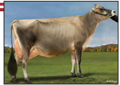
LAKE-POINT PREMIER VALYRIA Dam of Lot 10

5TH DAM: HURONIA CENTURION VERONICA 20J 97% 6-08 365 2 24442 5.6 1380 3.9 955 DHIR 3306C 2004 NATIONAL GRAND CHAMPION