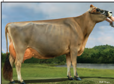
BUDJON-VAIL JADE GIANNA-ET Sister to the Dam of Lot 15