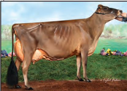
CARLY-O TEQUILA ALLEY {4} Grandam of Lot 9