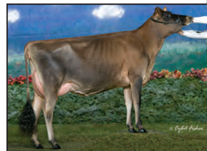
PARTEE AT BUDJON LYNDSEY-ET Sister to the Dam of Lot 36