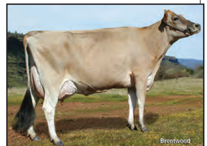
BW AVERY SUZANNE ET119-ET Fifth Dam of Lot A