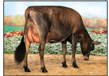
VALYRIAS ANDREAS VAVOOM-ET Sister to Lot 10