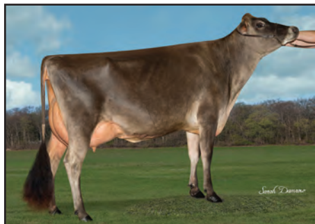
Sold in the 2016 All American Sale Lavon Farms Applejack Cheyene, E-93%