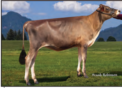
LADY LANE APPLEJACK KANZI Selling as Lot 23