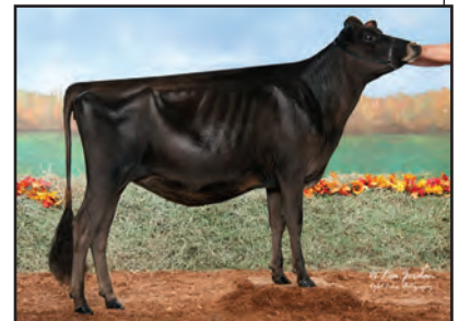
BIG GUNS ANDREAS VIRTUE-ET Sister to the Dam of Lot 26