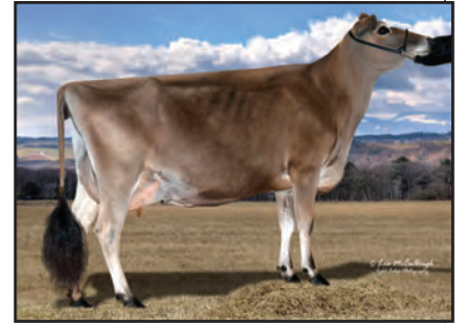
WOODMOHR INDIANA ROSEBUD Grandam of Lot 6