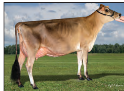
BUDJON-VAIL VIP MACKENNA-ET Dam of Lot 34

4TH DAM: HILLACRES MONAS MONIQUA 91% 4-11 305 2 18550 4.7 865 3.8 705 94DCR 2363C