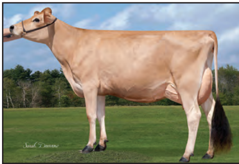
Sold in the 2014 All American Sale Orthridge-DB Prescott Radish, VG-87% 5-6 305 24,480 5.6% 1,388 3.8% 923