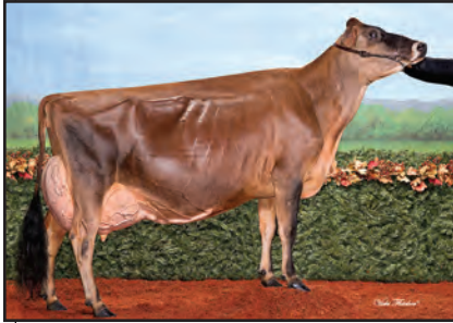
MUSQIE IATOLA MARTHA-ET Sister to the Dam of Lot 37