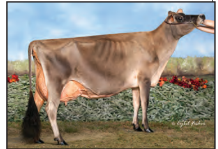
ARETHUSA VERONICAS COMET-ET Great-Grandam of Lot 14