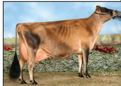
HURONIA CENTURION VERONICA 20J Great-Grandam of Lot 16