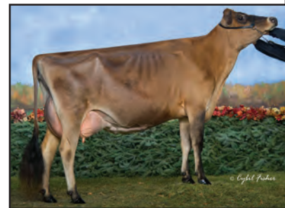
PARTEE AT BUDJON LAST CALL Sister to the Dam of Lot 36