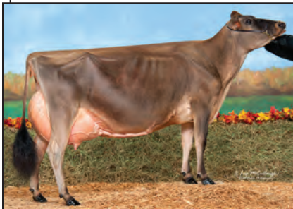
CASCADIA IATOLA PUZZLE Grandam of Lot 7