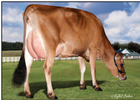
Sold in the 2014 All American Sale Ahlem Volcano Buttons 42731, E-91% 1-9 305 3x 16,930 5.8% 980 4.0% 673