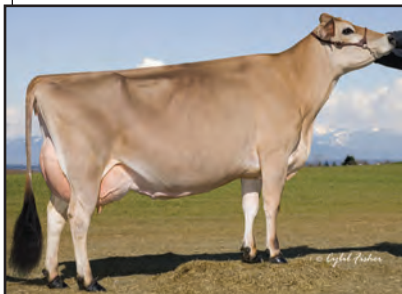
FAMILY HILL FIRST NADIA-ET Fourth Dam of Lot 17

RESERVE GRAND CHAMP, 2015 WASHINGTON STATE SHOW 1ST AGED COW, 2015 WASHINGTON STATE SHOW 3RD 5-YEAR-OLD, 2014 WESTERN NATIONAL 5TH 4-YEAR-OLD, 2013 WESTERN NATIONAL 1ST 4-YEAR-OLD, 2013 WASHINGTON STATE SHOW RESERVE GRAND CHAMP, 2013 WASHINGTON STATE SHOW 4TH JR 2-YEAR-OLD, 2011 WESTERN NATIONAL SIRE: GLENHOLME COUNCELLER GJPI -118 3%ILE