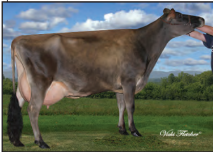
AVONLEA JED MAXIE-ET Grandam of Lot 37