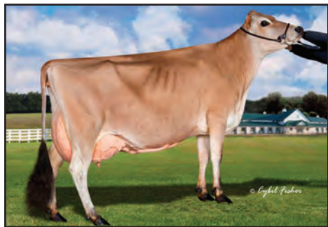
Sold in the 2010 All American Sale Sunset Canyon Headline Daffy 3-ET, E-90% 4-6 305 3x 24,060 4.4% 1,048 3.3% 795