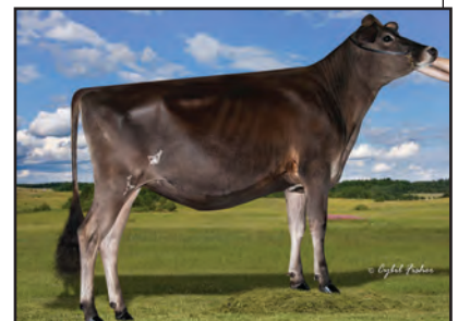
BIG GUNS ANDREAS VIENNA-ET Sister to the Dam of Lot 26