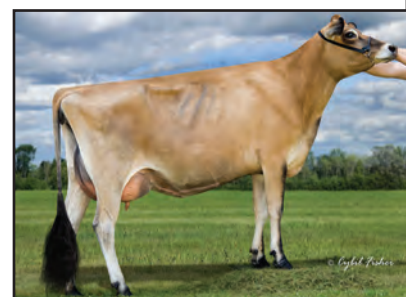
PARTEE AT BUDJON FUROR LAYLA Sister to the Dam of Lot 36