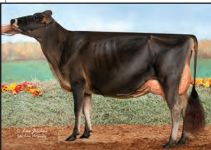
BILLINGS IMPRESSION BACKSTAGE-ET Sister to the Dam of Lot 35