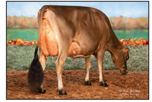
Sold in the 2019 All American Sale Starfields Classis Cosmopolitan, E-93% Projected to 22,032—947—771 ME at 4-9