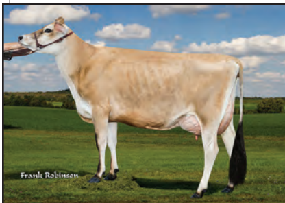
PUZZLES PANTHER-ET Sister to the Dam of Lot 7