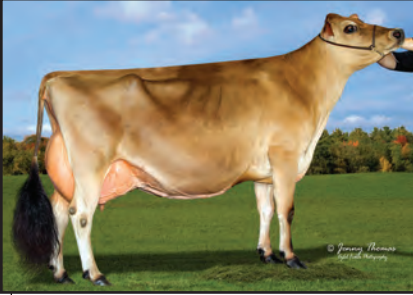
BILLINGS SULTAN BRYCE Sister to the Dam of Lot 35