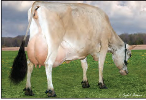
Sold in the 2004 All American Ahlem B John Princess 3183-ET, E-91% 6-9 305 3x 35,900 4.8% 1,728 3.2% 1,153