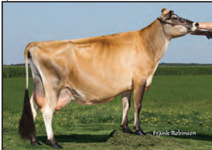
LADY-LANE JADE KLASSY {6} Great-Grandam of Lot 23