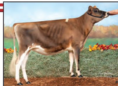
BUDJON-VAIL GOT THE VERDICT Selling as Lot 44