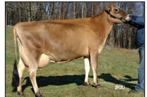
Sold in the 2008 All American Sale Pearlmont Impuls Daffy, E-90% 4-3 305 18,560 5.0% 932 3.8% 707