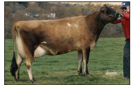
Sold in the 1994 All American Sale Billings Top Rosanne, E-96% 6-7 305 19,490 5.8% 1,138 4.1% 802 2-time National Grand Champion