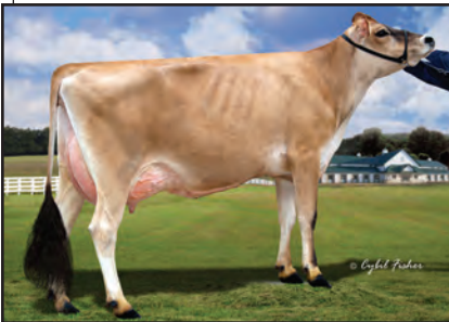
RIVER VALLEY METALICA BETSY 976 Sister to the Dam of Lot 21