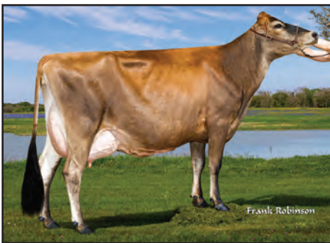
Sold in the 2013 All American Sale Ky-Hi Topeka Hopefull-P-ET, E-90% 3-0 305 3x 20,860 5.0% 1,040 3.7% 775