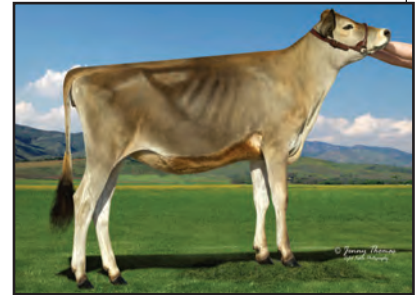
MISS METALICA FELICITY Dam of Lot 40