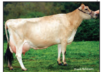
TENN HAUG E MAID Fifth Dam of Lot 20