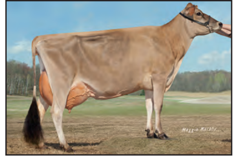
Sold in the 2011 All American Sale Hilmar Kilowatt 32102, E-93% 3-11 305 17,940 4.2% 757 3.4% 611