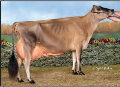
HILLACRES MORRAE MARYLAND Dam of Lot 33

4TH DAM: HILLACRES MAGGIES MONA 77% 5-04 305 2 20200 4.7 943 4.1 819 DHIA 2580C