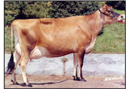
RENMOOR REMAKE BOBBIE Fifth Dam of Lot 32

NEXT DAM: EGGINK MASON BAMBI 90% 7-00 305 2 14610 4.5 656 3.7 537 96DCR 1794C SIRE: RATLIFF JUNO MASON-ET JPI -178 0%ILE