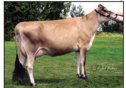
BRENODA JUDE LADYBUG Sister to the Grandam of Lot 30