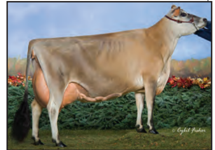
FAMILY HILL AVERY FIRE Fourth Dam of Lot 40