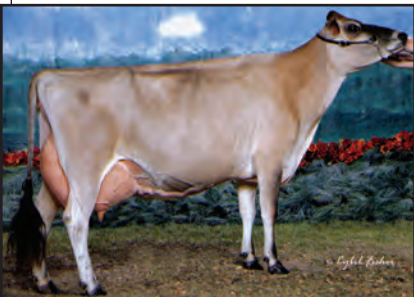
ROZEVIEV DORIE D RACHEL Grandam of Lot 5