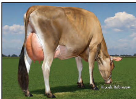
Sold in the 2009 All American Sale BW Renegade Katie ET749-ET, E-90% 6-2 305 3x 27,790 5.4% 1,504 3.8% 1,055