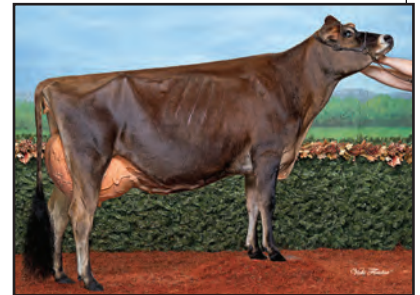
SCHULTE BROS TEQUILA SHOT-ET Sister to Lot 38