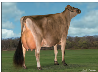
MISS NASTIAS NICE TEQUILA-ET Sister to the Dam of Lot 17

NEXT DAM: FAMILY HILL GOLDEN NAOMI 95% 2-11 305 2 17790 5.4 967 3.8 677 94DCR 2342C SIRE: GOLDEN BOY OF FERREIRA GJPI -69 3%ILE