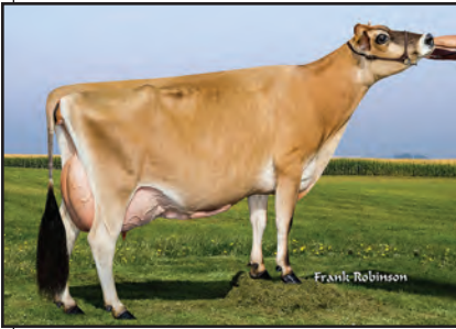
AHLEM CELEBRITY BESS 35536 Great-Grandam of Lot 21