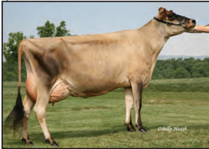
ELLIOTT'S GOLDEN VENUS-ET Sister to the Dam of Lot 11 & 12

SELECT-SCOTT MINISTER-ET JECAN000101483843 GTHD BBR 100 JH1F 200JE427 CDCB GPTA S 08/01/2020 1990DAUS 900HRDS 4%RIP 99%R -2248M 0.21% -69F 3%ILE 99%R 0.10% -64P -448CM$ -450NM$ -458FM$ -344GM$ -0.4PL 2.3LIV 2.9DPR 3.0CCR -2.1HCR 3.15SCS 0.1MFV -0.4DAB -0.6KET 0.3MAS 0.3MET 0.3RPL -0.75HTI AJCA 08/01/2020 1418DAUS GPTAT 98%R -0.2 GJUI 0.6 GJPI 96%R -140