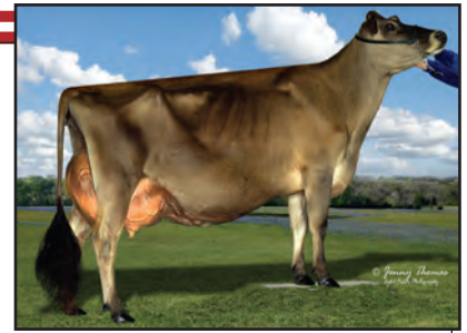
BIG GUNS JAMAICA VANILLA Dam of Lot 26

NEXT SIX DAMS ARE VERY GOOD OR EXCELLENT