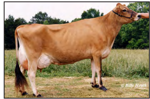
Sold in the 1995 All American Sale Amitys Barber Pine, E-94% 5-7 305 21,460 4.9% 1,060 3.5% 759