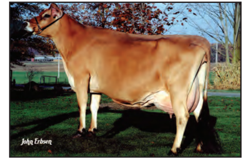
Sold in the 2005 All American Sale Vantage Lemvig Mamme, E-90% 4-4 305 3x 27,440 4.8% 1316 3.6% 996